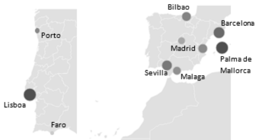
Figure 1: Map of search density for Airbnb in Portuguese and Spanish cities